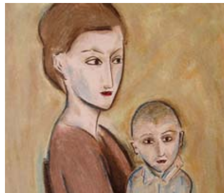
Robert Dickerson, Mother & Child (detail)