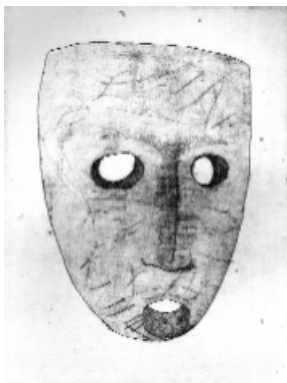
Damon Kowarsky, M1