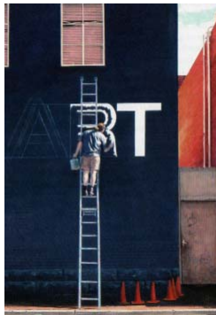
Tony Irving, Art at the top (2004)

McCulloch's Encyclopedia of Australian Art is available in all good bookstores or can be ordered through Aus Art Editions: ph (03) 9347 1022 or online at www.ausart.com.au .