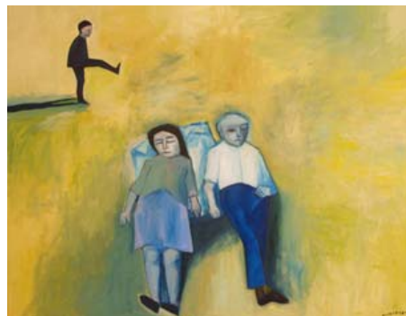
Robert Dickerson, The Vacationers

In addition to his drawing exhibition with the Sydney gallery throughout January and February, Robert Dickerson will showcase an exhibition of major works with Philip Bacon Gallery , Brisbane, in the latter part of 2007. An interesting painting to be included in the show which the artist is currently working on is a painting of the House of Representatives at Parliament House, Canberra. In researching the work Dickerson visited Canberra and sat in on question time, observing Howard and Beazley going through their antics. This should prove interesting material for the artist to work with.