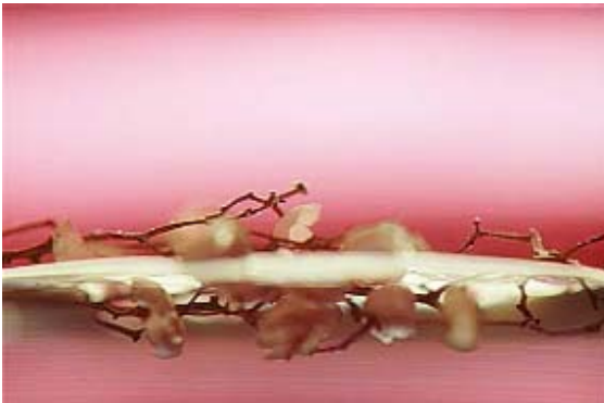
Alison Langley, Momentary lightbox, 61 x 93 x 12cm