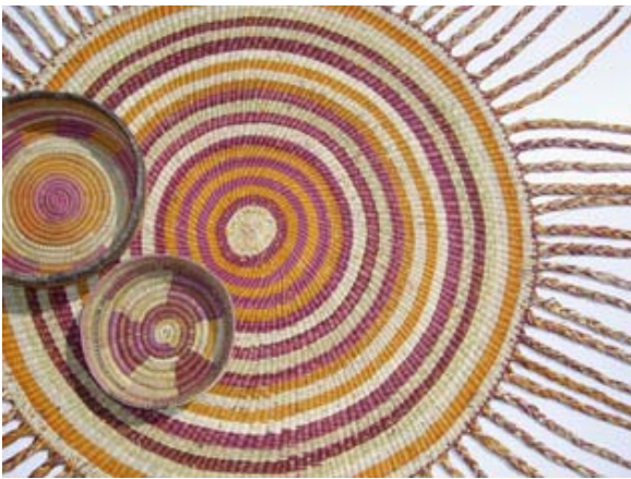
Dianne Narorrga woven pandanus mat, 100cm D