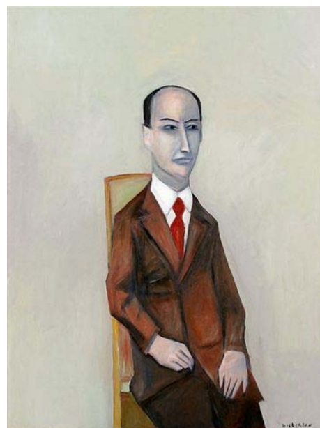
Robert Dickerson, The Managing Director (2006)

Robert Dickerson is preparing for a big year with exhibitions in Sydney, Perth and Brisbane. Following another successful exhibition of new works on paper in the Sydney gallery over the past two months, Dickerson has been busily working on a series of drawings and paintings to be exhibited with Stafford Studios in Cottesloe, Perth. Dickerson has been exhibiting with Stafford Studios since the late 90s and has achieved great success in Perth over the years. The artist is also painting for an exhibition of major works with Philip Bacon Galleries , Brisbane (July 3 – July 28). The 82 year old has selected over 20 paintings to be part of the show. Dickerson was one of the first artists to exhibit with Philip Bacon Galleries in the mid 70s, and has maintained a long standing relationship with the gallery ever since. These exhibitions mark the significance of the self taught artist's magnificent career in Australian art history. Dickerson has had over 100 solo exhibitions spanning the past 50+ years. The demand for his work continues to rise, as does the prices realised in auction houses today.