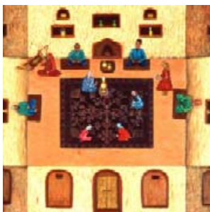
Abbas Mehran To Khuneh Dam Be Dam Mehmuni Bood (detail)