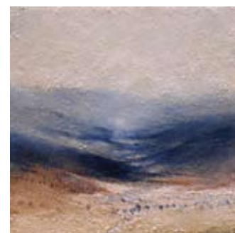
Summer Hills Anthony Day