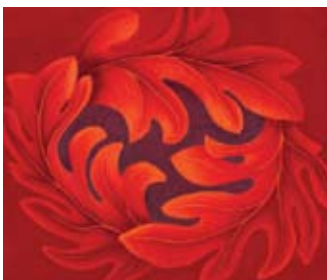
Baby baroque Filomena Coppola

Filomena Coppola: 1 - 19 April Moon shadows